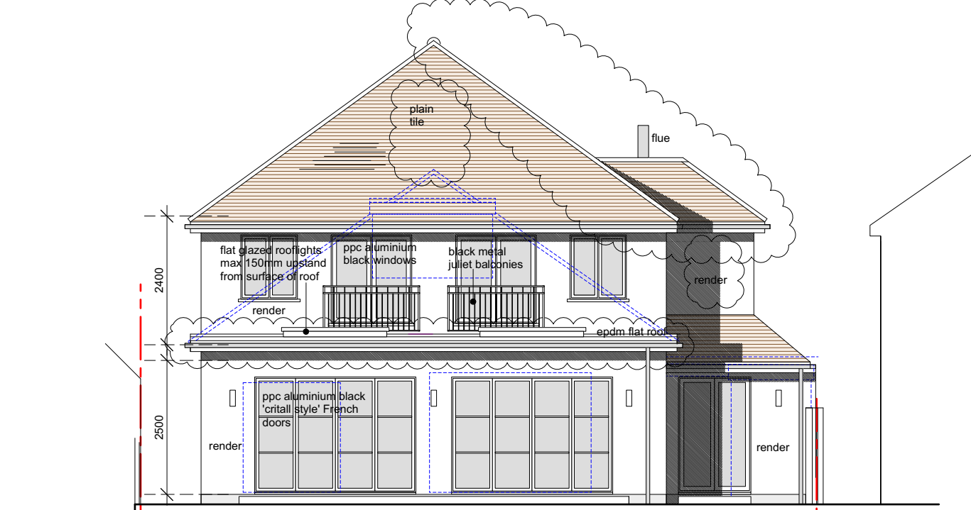
NORTH-EAST (REAR) ELEVATION